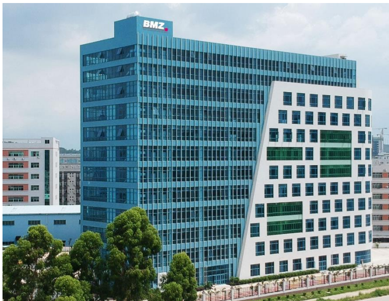
Caption: The new headquarters of BMZ Ltd. in Shenzhen in the Longgang Julong Industrial Park, which extends over 12 floors.